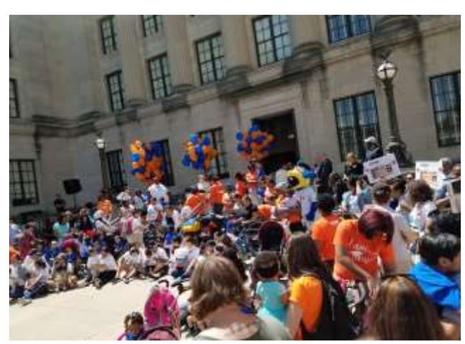
Strolling Thunder: On May 21, 2018, advocates, parents, and nearly 150 babies gathered in front of the State House Annex to tell lawmakers to make infants and toddlers an important state priority.

As a result, the Foundation and the Turrell Fund supported an ACNJ initiative, Right From the Start NJ. This initiative was designed to educate the public,