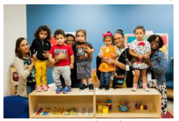
A Greater Bergen CAP Early Head Start classroom.

From 2014 to 2018, the Foundation also supported a parallel quality improvement project for family child care providers called Steps to Quality. More than 40 providers in Mercer, Essex, and Middlesex Counties ultimately participated. The effort was led by Child Care Connection, Inc., Mercer County's Child Care Resource and Referral agency, in collaboration with two other agencies—Essex County's Programs for Parents and Middlesex County's Community Child Care Solutions. This project became the